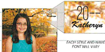
EACH STYLE AND NAME FONT WILL VARY

Personalize your selected style by ADDING YOUR NAME to each print. Personalizo su estilo seleccionado al AGREGAR SU NOMBRE a cada impresión.